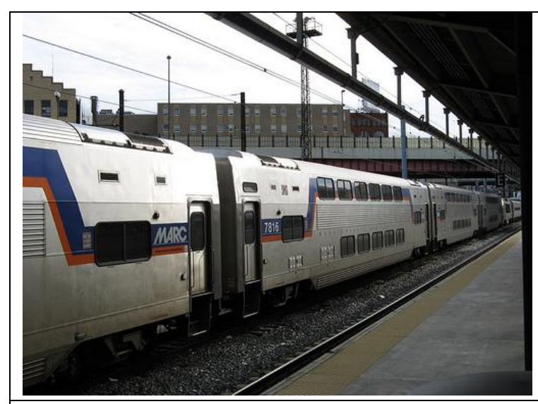
MARC commuter train providing service between Baltimore, MD and Washington, DC