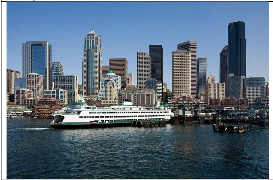
Ferry providing transportation between Seattle, WA and nearby islands