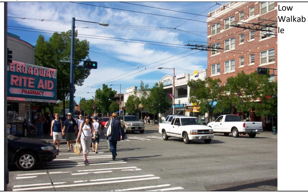
High Walkab le