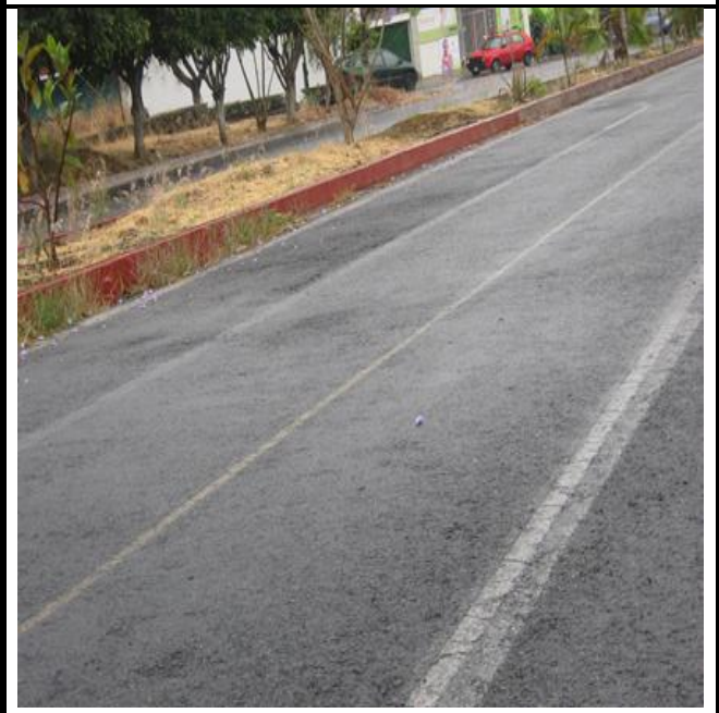
Delimitation of bicycle lanes for use