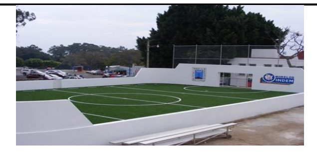
Area indoor soccer, sport more popular in Cuernavaca