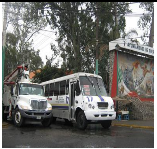
Buses called "Pesero" are the main means of transportation