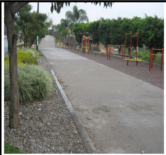
Area short for bicycle use

4. Bike Lanes/Paths – The photos show bike lane infrastructure in different parts of the city. Cuernavaca does not have a formal and ongoing bike path , only very small sections. Cuernavaca has no signage for bicycles.