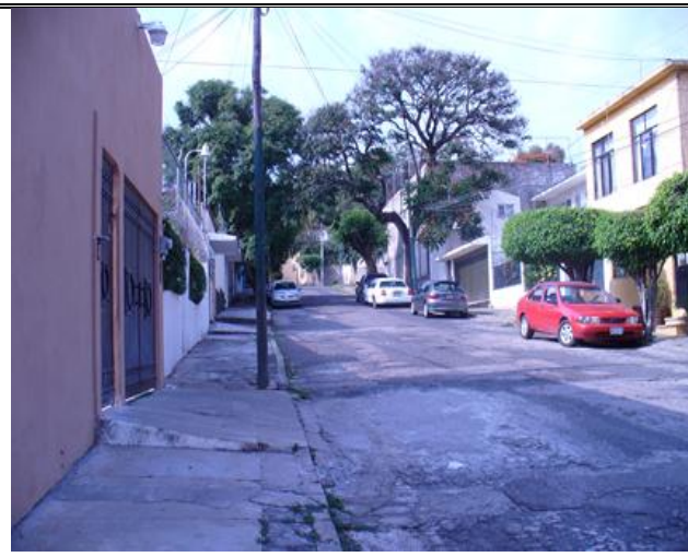
Pedestrian walkways high SES