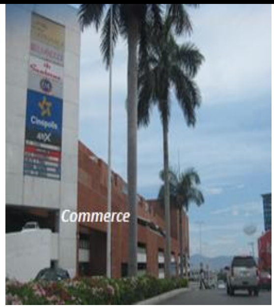
High walkability, High Income

3. Land Use –Mixed land use is very common in Bogotá. Photos neighborhoods reflect mixed land use and some with exclusive use.