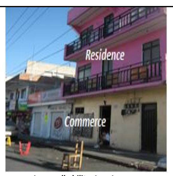
Low walkability, Low Income