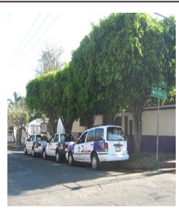
Taxis is the second transport means