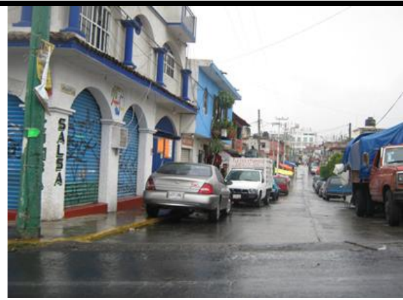
Pedestrian walkways blocked, something very common in Cuernavaca