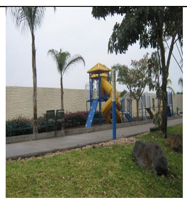
Area short for bicycle use and playgrounds