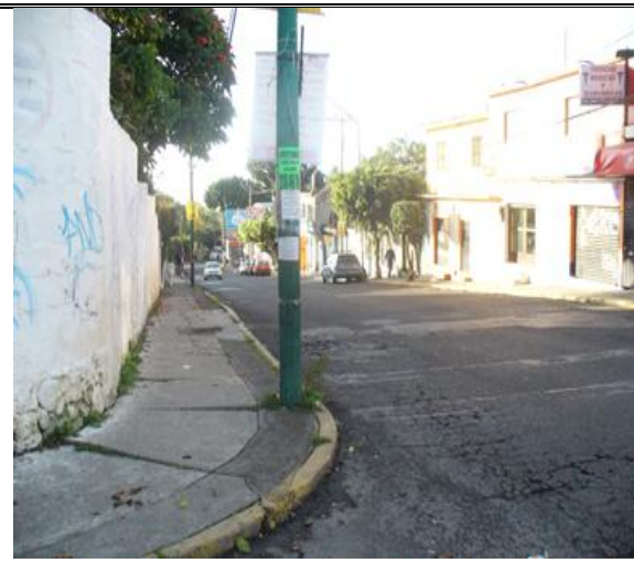
Pedestrian walkways low SES