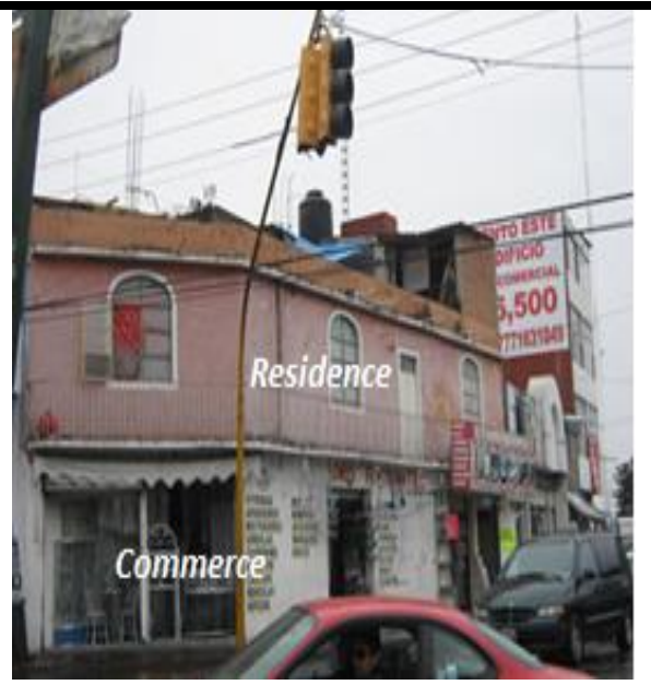
High walkability, Low Income