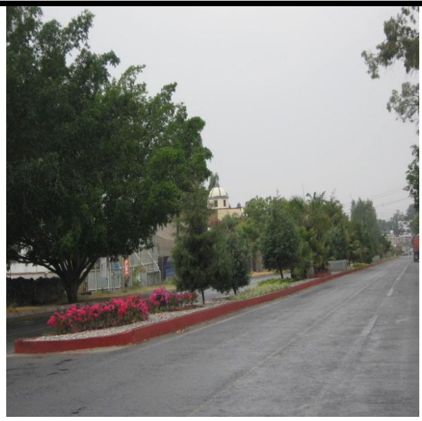
Area for Ciclovia weekends, distance of 300 mts.