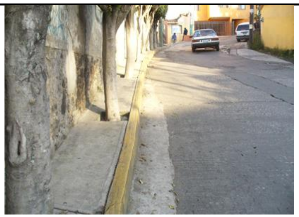
Pedestrian walkways blocked, something very common in Cuernavaca