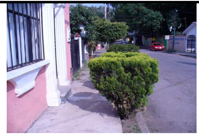
Narrow pedestrian walkways

7. Pedestrian Streetscapes – In these pictures we show the differences in the experience of walking in different parts of the city, Cuernavaca has generally blocked roads for walking, narrow and most of the city does not exist. Few neighborhoods are suitable roads for walking.