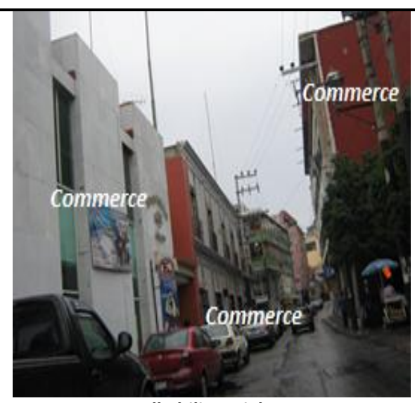
Low walkability, High Income