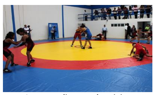
Area wrestling, youth training