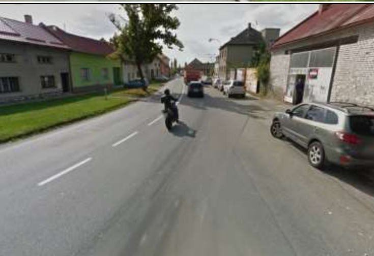
Low walkability, High SES