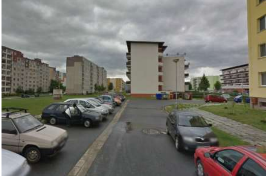
Prefabricated blocks of flats