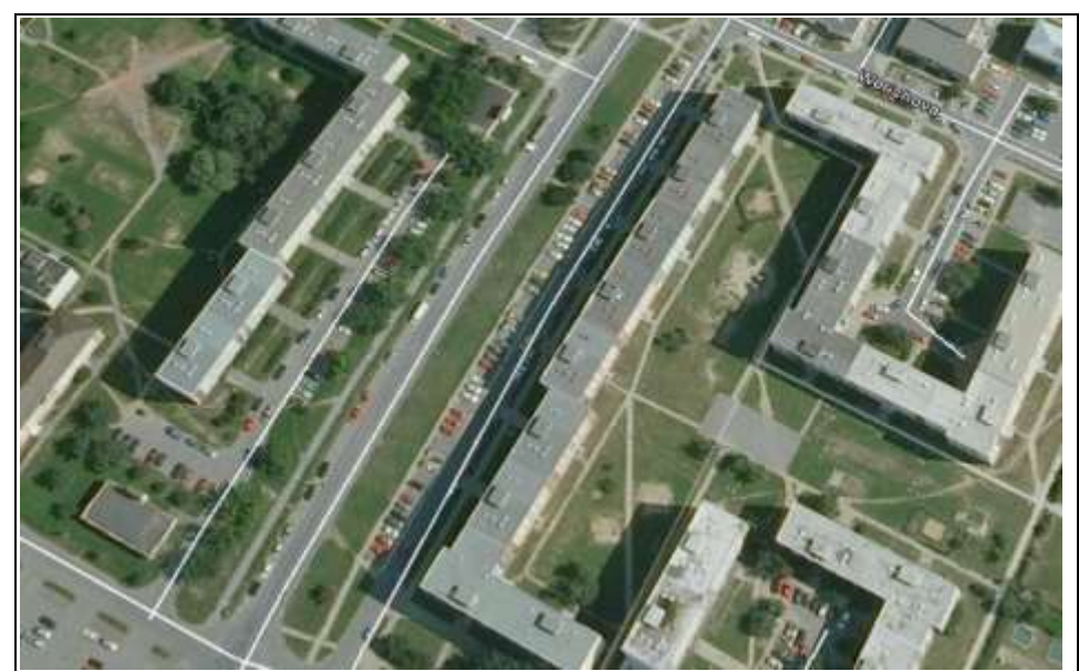
Prefabricated blocks of flats High residential density Residential land use only