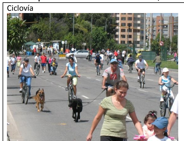
Every sunday 121 km of avenues are closed to cars and used by bicycles, pedestrians and skaters