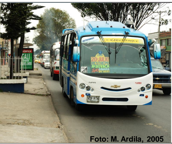
Buses that do not have stations and stop anywhere