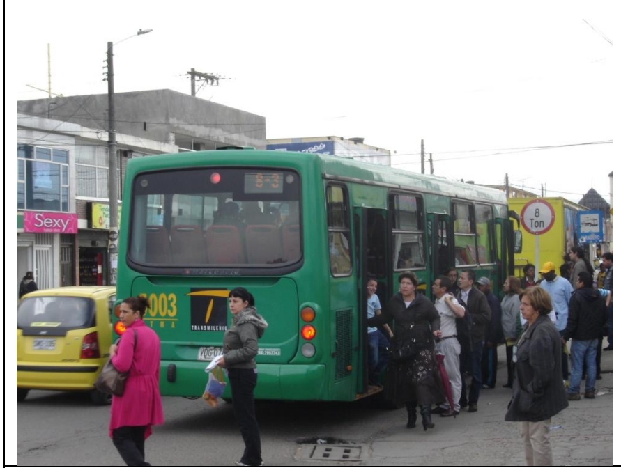
Feeder buses that connect with BRT system TransMilenio