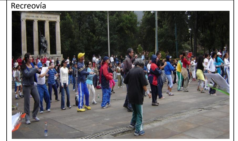
The Recreovía is a program of aerobic classes and other activities within parks and public spaces